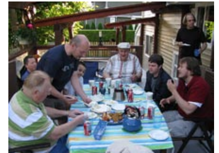
Men's BBQ last summer

On February 1st, the church will confirm who God is leading to serve as deacons.